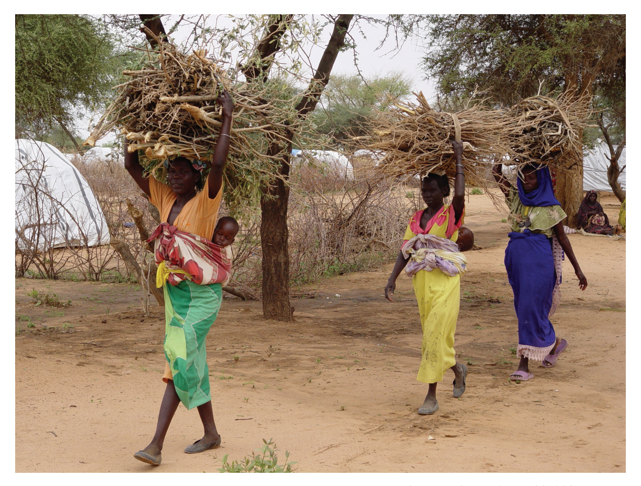
Photography credit: withheld by request